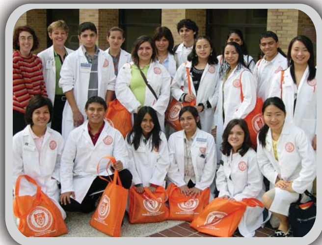
Med Ed Program students at the UT Health Science Center at San Antonio during Field Experience II, July 2008.

If you have any questions, please do not hesitate to contact either office for assistance. ***